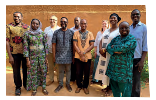
Photo: Community-based projects help women affected by leprosy and from marginalised communities to become entrepreneurs and pursue sustainable livelihoods

The Leprosy Mission Niger works in six regions in Niger: Tilaberi, Niamey, Tahoua, Dosso, Zinder, and Maradi. We partner with the National Leprosy Control Programme, Regional Leprosy Control Departments, CSL Danja Hospital, IDEA-Niger (an association of persons affected by leprosy), and Organisation pour le Développement Inclusif (ODI-Niger).