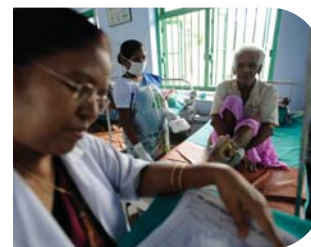
Staff and patient at Muzaffarpur Hospital