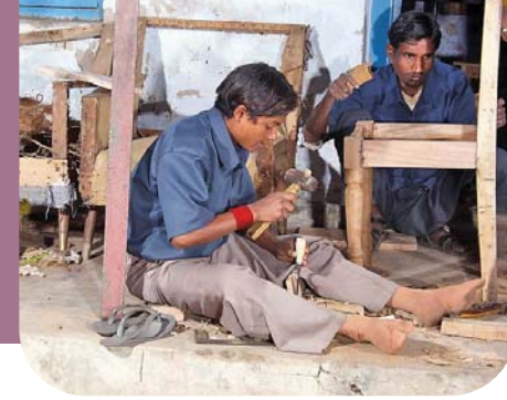
Carpentry students at Bankura VTC