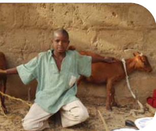
Son of a leprosy-affected family in Nigeria being supported by TLM

FACTFILE APPROX 20,000 LEPROSY-AFFECTED PEOPLE LIVE IN THE EIGHT STATES IN NIGERIA WHERE TLM WORKS