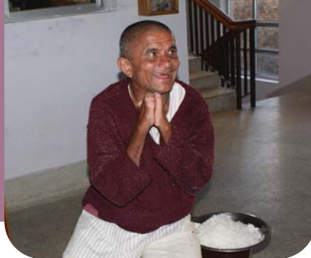
A patient at Anandaban Hospital

'O Lord, be gracious to us; we long for you. Be our strength every morning, our salvation in time of distress,' Isaiah 33:2