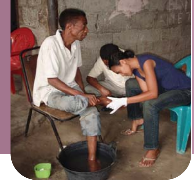
Learning self-care in Timor Leste

'But those who hope in the Lord will renew their strength. They will soar on wings like eagles; they will run and not grow weary, they will walk and not be faint,' Isaiah 40:31