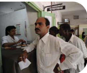
Champa hospital pharmacy