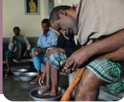
Practicing self-care at DBLM Hospital in Nilphamari