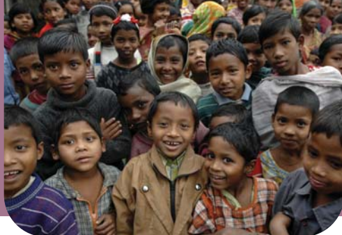
Village children watching a health education drama in Bangladesh

'And the peace of God, which transcends all understanding, will guard your hearts and your minds in Christ Jesus,' Philippians 4:7