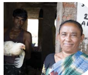
This husband and wife from Salur received a micro-credit loan to buy chickens

Growth: Thank God for the work of Belgaum Hospital; there has been an increase in the number of general patients accessing the hospital's services which helps to decrease leprosy-related stigma. Pray for the staff and their families, that they will grow spiritually and that their dedication to leprosy work will be strengthened.